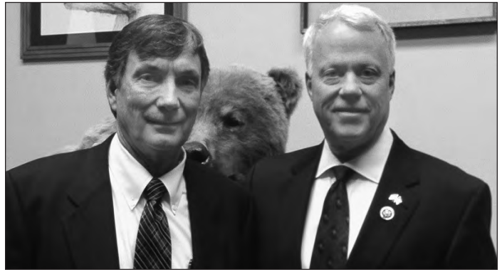
Rep. Paul Broun (right) is retiring and will be sorely missed by gun owners in Georgia’s Tenth District. But his most likely replacement, Jody Hice, will definitely take up the pro-gun mantle.

Alex Mooney is running for West Virginia’s 2nd Congressional District, as Shelley Moore Capito vacates the seat to run