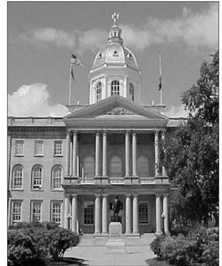
The state house in Concord, New Hampshire.