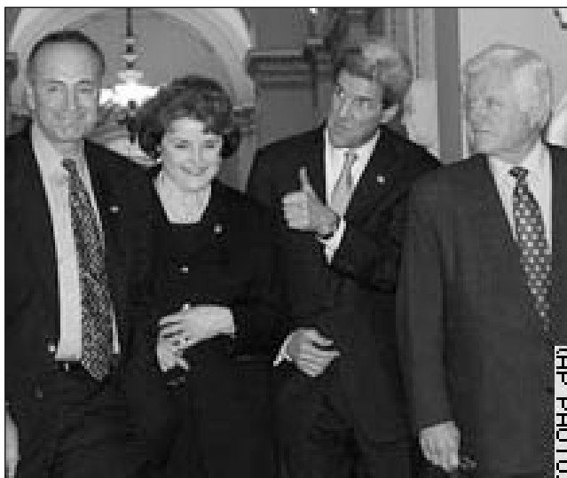
The "Three Amigos" of gun control pose with Democratic presidential contender John Kerry (second from right) after the semi-auto ban initially passed the Senate. The prohibition died moments later when the underlying bill was defeated, thus killing all the gun control amendments with it.

On March 2, Senators almost unanimously agreed to kill the bill (90-8),