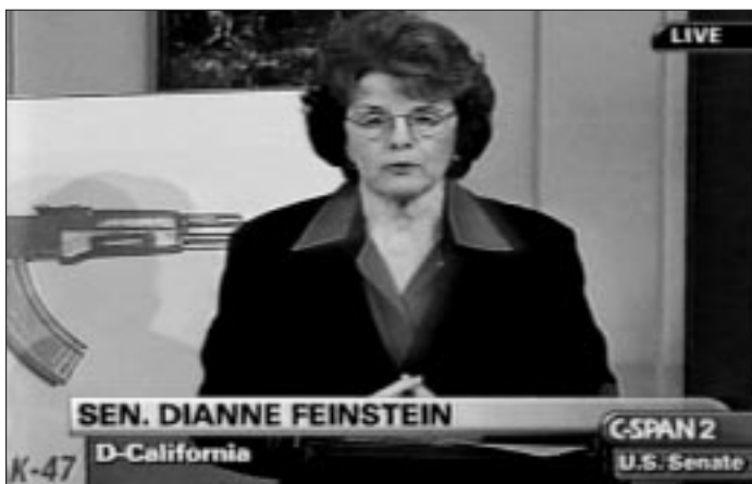
Senator Dianne Feinstein (D-CA)

Remember, you always kill a poisonous snake the first chance you get. One can only assume that a conference committee will “take care of the problem” if one ignores the determination of Ted Kennedy, Dianne Feinstein and Chuck Schumer.