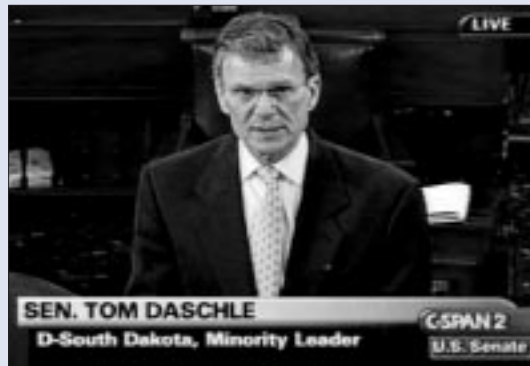
Senator Tom Daschle (D-SD)

In addition to Daschle, there were ten other "switch hitters" including Senators Breaux (D-LA), Lincoln (D-AR), Collins (R-ME), Dorgan (D-ND), Gregg (R-NH), Hagel (R-NE), Landrieu (D-LA), Reid (D-NV), Smith (R-OR) and Snowe (R-ME).