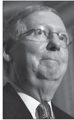
Sen. Mitch McConnell was incensed over the deal that liberal House Democrats offered the NRA.

We stand shoulder to shoulder with NRA and all the other pro-gun groups when they are fighting to defend our Second Amendment freedoms. We all