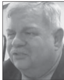
Rep. Phil Hare (D-IL) says that what’s in the Constitution “doesn’t matter to me.”

• And then there’s Congressman Phil Hare (D-IL) who was asked the same question this year regarding the authority to pass ObamaCare. Rep. Hare’s responses — which can be viewed on YouTube using a search for “Hare” and “Constitution” — are very enlightening.