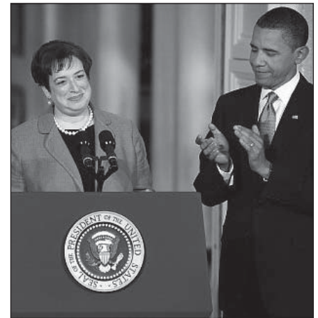
Obama favorite Elena Kagan has lamented that socialism “never attained the status of a major political force” in the U.S.

And according to Politico.com (March 20, 2009), she says that foreign law can be used to interpret the U.S.