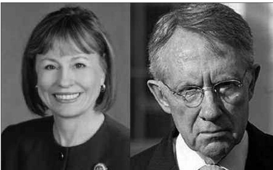
Nevada's Sharron Angle started out in single digits in a three-way race, but with the help of GOA won her primary against two establishment candidates and now faces anti-gun Senator Harry Reid in the general election.

parties. The 1994 election was driven largely from the top-down by Washington insiders like Newt Gingrich, who simply believed in a different form of big government than the politicians they replaced.