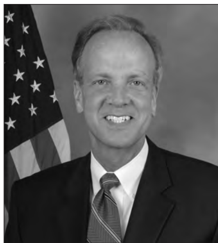
Senator Jerry Moran (R-KS)

That’s a shift from the Bush administration, which declared the ATT dead-on-arrival. President Bush wouldn’t have delivered the treaty to the Senate for ratification, but Obama can’t wait to use this vehicle as a way to show his anti-gun base that he is doing something on the gun control front.