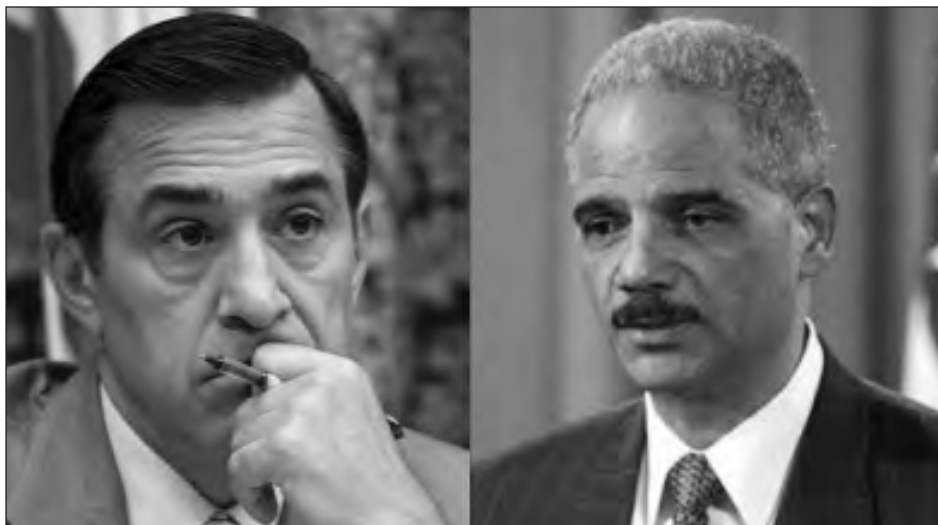
Rep. Darrell Issa (R-CA) and Attorney General Eric Holder

“Some within House GOP leadership circles would like Issa to abandon his plan for a committee and floor vote .... They fear negative political fallout from citing the U.S. attorney general with contempt of Congress in an election year.”