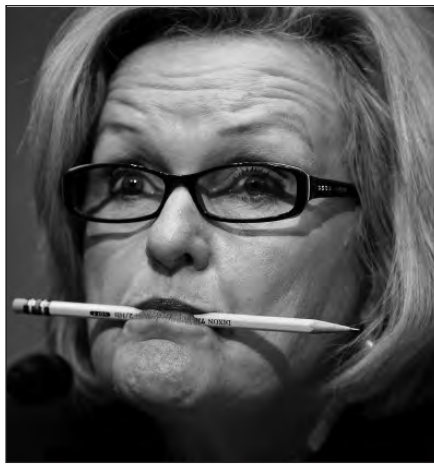
Senator Claire McCaskill (D-MO)

Sen. McCaskill also voted against the amendment to repeal the Amtrak gun ban on her first opportunity. (See