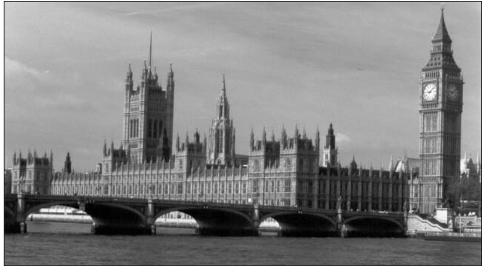
The British government is divided over why draconian gun restrictions have led to a spike in crime.

Home Secretary David Blunkett announced the new punishment, and then following a recent summit released other initiatives, including an amnesty