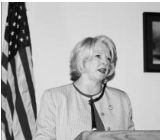
Colorado Representative Marilyn Musgrave has been one of the chief forces bringing the Second Amendment Caucus together on Capitol Hill. The caucus is made up of more than four dozen Congressmen who are dedicated to repealing federal gun control legislation. (See page 3 of the June 28, 2004 issue of The Gun Owners for more information on the Second Amendment Caucus.)