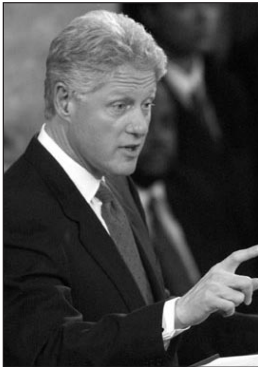
In his State of the Union message in 1995, President Clinton admitted that several House Democrats lost their seats in the '94 election after having voted for the semi-auto ban.

Of course, the truth is Sen. Feinstein would prefer to do more than simply extend the ban, but rather make it permanent and retroactive. As the elitist Senator said on 60 Minutes in 1995, "If I could have gotten 51 votes in the Sen-