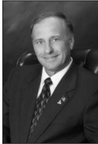
Rep. Steve King (R-IA) is the most recent Congressman to pull his name as a cosponsor of the anti-gun education bill. So far, GOA members have encouraged nine Representatives to pull their names from H.R. 1078.

Once the problems with the bill were made known to the pro-gun community, the chief sponsors of the bill tried to