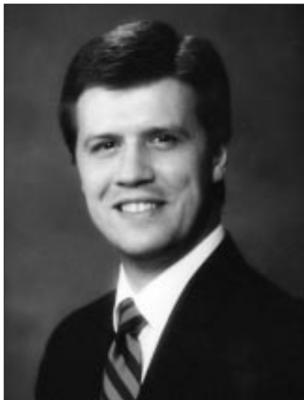
Pro-gun Rep. John Hostettler (R-IN) has introduced legislation that will require states to recognize the right of out-of-state citizens to carry concealed firearms.

In short, the measure treats Alaskans as citizens who have an inherent right to possess firearms instead of being treated as subjects who must approach the government like beggars seeking