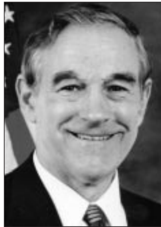
Rep. Ron Paul (R-TX) has forced two gun-related votes this year.

Get the U.S. out of the anti-gun U.N. Rep. Ron Paul (R-TX) offered an amendment on July 15, 2003 which would have pulled the United States out of the United Nations. While his amendment failed, Rep. Paul argued that this country should boycott the international gun control organization which is actively taking guns away from civilians and trying to determine our gun laws. "It wants to ignore our Bill of Rights and try American citizens in its phony international courts," Paul said. "At some point, the American people will have to choose between American national sovereignty and an increasingly powerful UN global government."