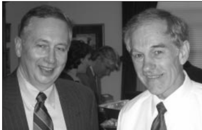
Texas Rep. Ron Paul (right)