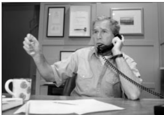
After GOA alerted its e-mail activists in mid-April, thousands of gun owners contacted the President to protest his support for the Clinton-Feinstein gun ban. In the first 24 hours alone, Gun Owners generated more than 10,000 contacts to the White House, prompting Senior White House official Carl Rove to admit that he's received a "tremendous amount of e-mail" on this issue.