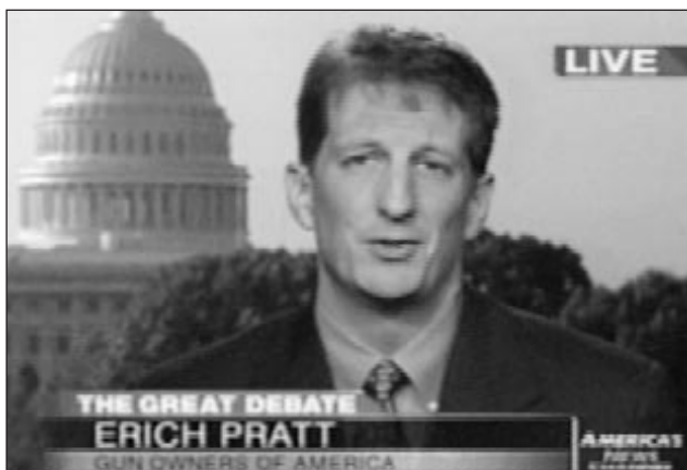
"Even though it does not attract headlines as the NRA does, Gun Owners of America is regarded as a key player [on Capitol Hill]." -- The Hill newspaper, October 29, 2003

caused him to lose three pro-Democratic and pro-gun states (Tennessee, West Virginia and Arkansas). It was only then that the lesson finally sunk in for many top-level Democrats.