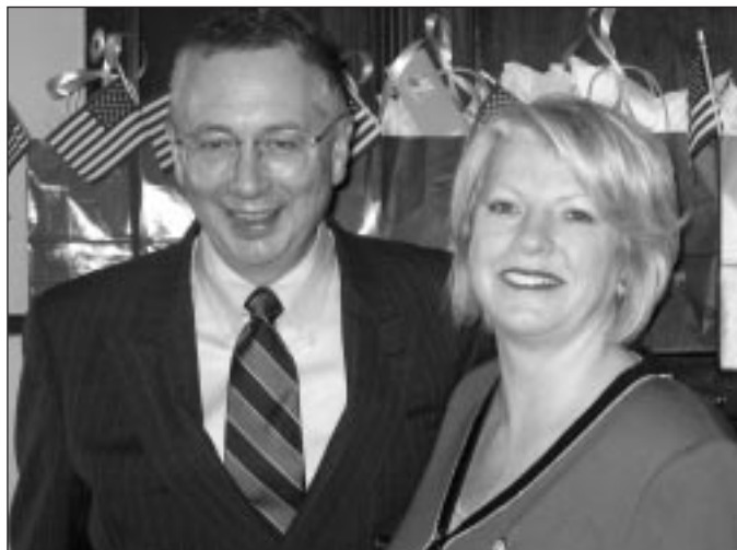
Rep. Marilyn Musgrave (above), and five other cosponsors, pulled their names from an education bill after GOA alerted them to the dangers the bill posed for American gun rights. At one time, the bill was on a fast track to the President's desk, but e-mails and faxes from GOA activists have helped stall the bill for now. According to The Hill newspaper, the sense in Washington is that before the legislation is voted on in the House, it must be "amended to address the Gun Owners of America's concerns."