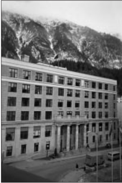
The Alaska state capitol in Juneau. GOA mobilized grassroots activists in the state as legislators were debating a bill to let citizens carry firearms without a permit. The legislation passed by overwhelming margins in both houses, and was signed into law in June.