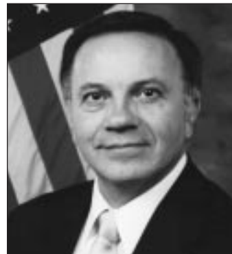
"A [CO Rep. Tom] Tancredo aide said the concerns raised by Gun Owners of America played a major role in the lawmaker's decision to withdraw his name as a co-sponsor" of an anti-gun education bill. -- The Hill, October 29, 2003

GOA will also continue fighting for real concealed carry in the states.