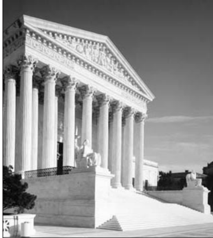
Gun Owners of America, along with a group of other plaintiffs, has gone to the Supreme Court to challenge the constitutionality of election laws that squelch GOA's ability to use radio or television to hold legislators accountable for their voting record. During oral arguments before the Court in September, several of the Justices revealed they were familiar with GOA's written brief as they used GOA's arguments to poke holes in the government's case.