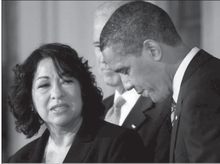
President Obama and Justice Sonia Sotomayor

Supreme Court and by appellate judges for not following precedents and statutes.