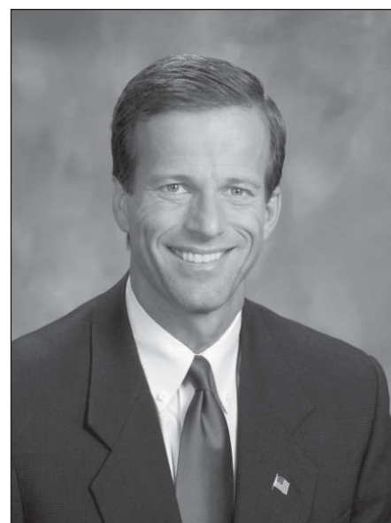
Senator John Thune (R-SD) was the lead sponsor of the concealed carry reciprocity amendment which came just two votes shy of overcoming a filibuster in July.

2. Anti-gun Supreme Court Justice. The Senate confirmed the nomination of Judge Sonia Sotomayor to the U.S. Supreme Court on August 6, 2009. Sotomayor has held that there is “not a fundamental right” to keep and bear arms, and that the Second Amendment — whatever little it protects in her estimation — does not apply in the states, only in Washington, DC. Also, when asked during the Senatorial hearings if she favored the right of self-defense, Sonia Sotomayor stated that such a proposition was an “abstract question” and that she couldn’t think of a Supreme Court case that addressed that issue. However, she ignored the more than a dozen cases where the high Court has examined the issue. The vote to confirm Sotomayor was 68-31. A vote against the nomination is rated as a “+”.