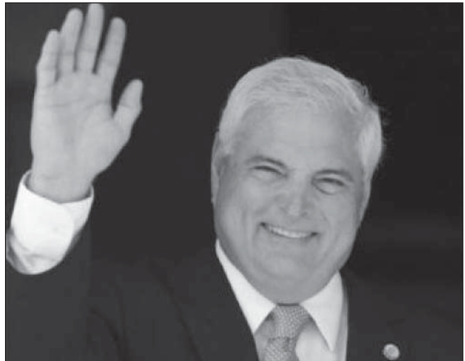
Panamanian President Ricardo Martinelli