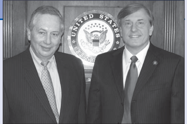
GOA Executive Director with Rep. John Fleming (R-LA), who as a freshman congressman has a perfect voting record on Second Amendment rights.

— Redstate.org, “On Sotomayor ... The Great, the Good, the Bad, the Ugly and the Pathetic,” August 7, 2009