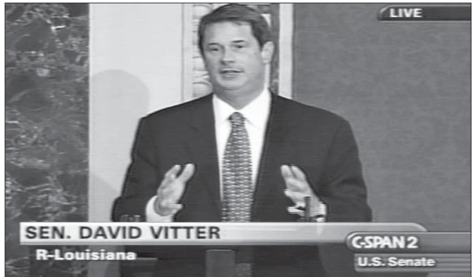
Louisiana Senator David Vitter acknowledged GOA during floor debate on the concealed carry amendment.

One was Democrat Mark Pryor of Arkansas. When it became clear the anti-gunners had a