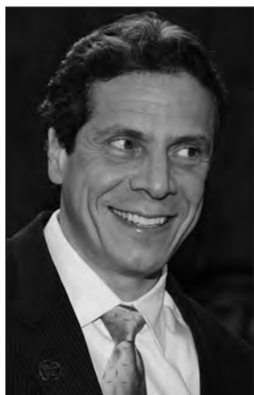
New York Governor Andrew Cuomo (D) recently stated that, among all the legislative proposals he was considering, gun "confiscation could be an option." (New York Times, 1/9/13)