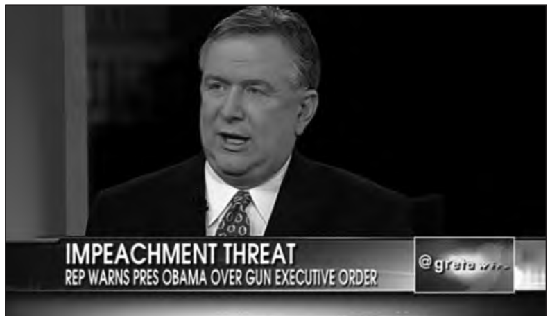
Rep. Steve Stockman (R-TX) is leading the charge in the House to stop the President’s gun control agenda.

Since the Sandy Hook shooting, spokesmen for Gun Owners of America have defended our rights in hundreds of media outlets. In one debate, the anti-gun spokesperson actually said, “I don’t know what you’re talking about in regard to registration” and insisted that nobody was trying to take away our guns.