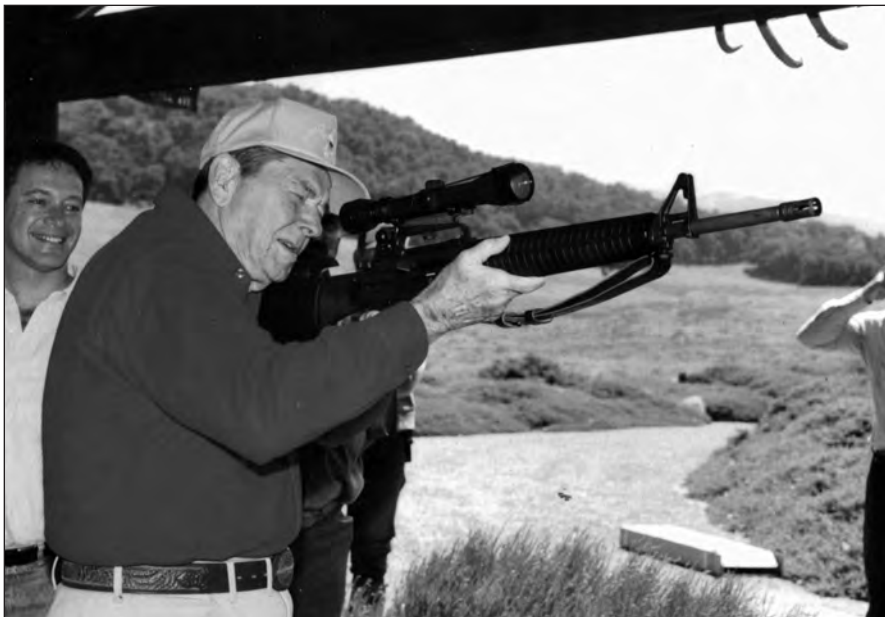
President Ronald Reagan sights in his Colt AR-15 in 1992.