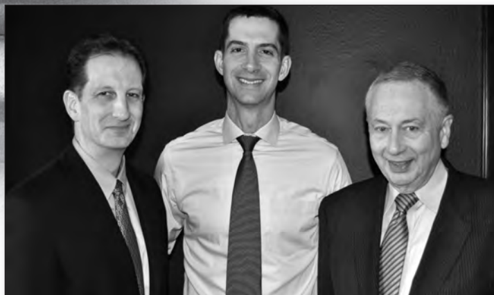
GOA met with newly-elected, "A" rated Congressman Tom Cotton (R-AR) in January. GOA's Political Victory Fund strongly supported Cotton in the recent elections.