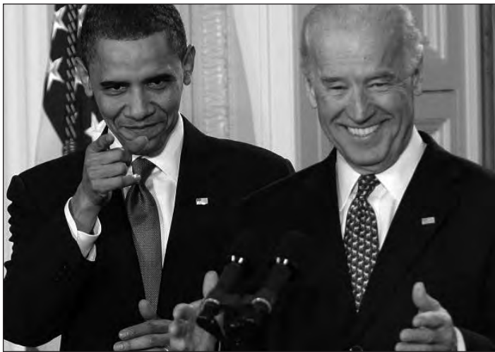
Coming for our guns: Barack Obama and Joe Biden have launched a full-fledged assault against the rights of American gun owners.

Such delays could be deadly for any person, especially