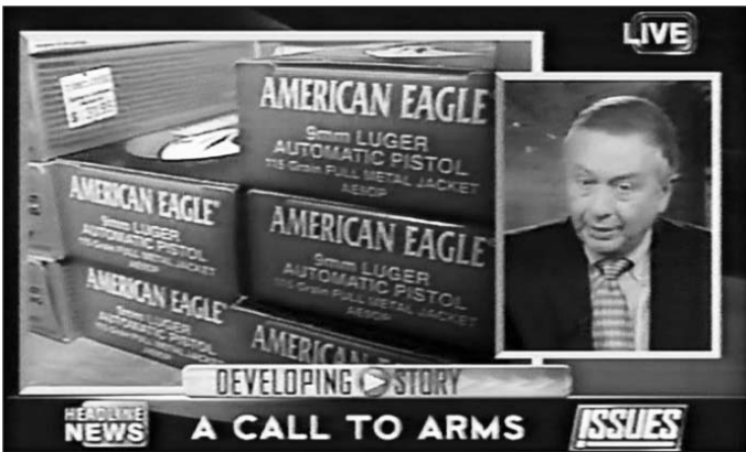
Gun owners’ fear of increased Second Amendment restrictions has resulted in runs on ammunition — and hence, shortages — in several states.

Criminal penalties of up to ten years and virtually unlimited