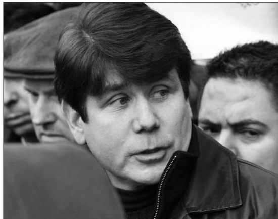
The media “gets it” when a sitting governor — like Rod Blagojevich (D) — tries to get some newspaper editors fired, but they don’t seem to mind when it’s gun owners’ rights that are getting trampled.

Blagojevich who, even though he owned a state issued Firearm Owners ID card, did everything he could to restrict the ability of average citizens to own guns?