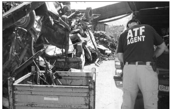
An ATF agent prepares to destroy guns that were seized in the United States. While all the police authorities quoted during the NatGeo show took an anti-gun view, the truth is that polls of police chiefs and sheriffs every year reveal they overwhelmingly hold pro-gun attitudes.

But even though supposedly neutral programs like National Geographic are peddling the Brady Campaign's favorite