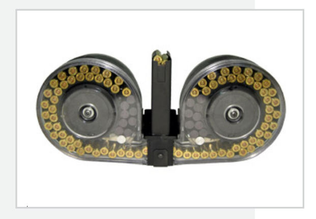
100-round Drum Magazine.