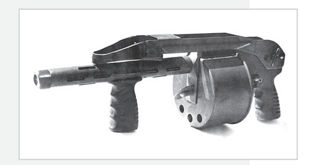
Armel Sriker shotgun.

Since then, the firearms industry has designed weapons that are lighter than the Street Sweeper and do not share its two pistol grips. These design modifications have enabled the firearms industry to argue that these newer weapons are not "destructive devices," although ATF has still questioned whether they are suitable for sporting purposes. These newer high capacity shotguns share the Street Sweeper's firepower and ability to hold a dozen rounds or more. The firearms industry has marketed these anti-personnel firearms as tactical shotguns. Today, semi-automatic and pump shotguns capable of holding 15 rounds or more, previously marketed to law enforcement, are being sold to civilians.