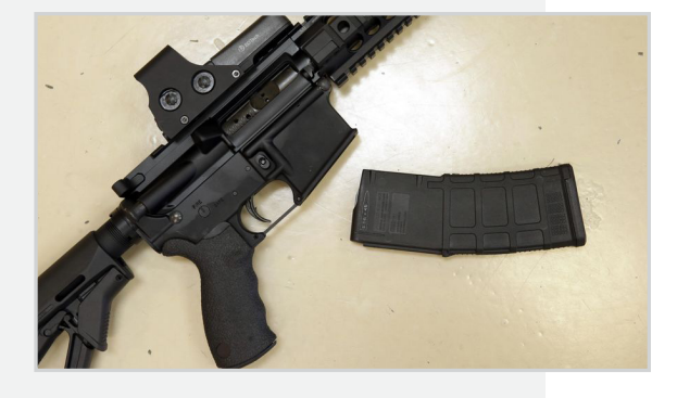
Semi-Automatic rifle and large capacity magazine.