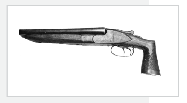
Ithaca Auto & Burglar Gun, classified as AOW by ATF.