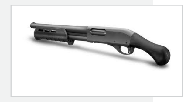
Remington Model 870 Tac-14.

The Remington Model 870 Tac-14 is a similar gun. It has a 14-inch barrel and 26.3-inch overall length and fires shotgun shells. Pew Pew Tactical, a popular gun enthusiast blogger, confirms Remington's strategy to aid and abet people who want to work around the NFA.