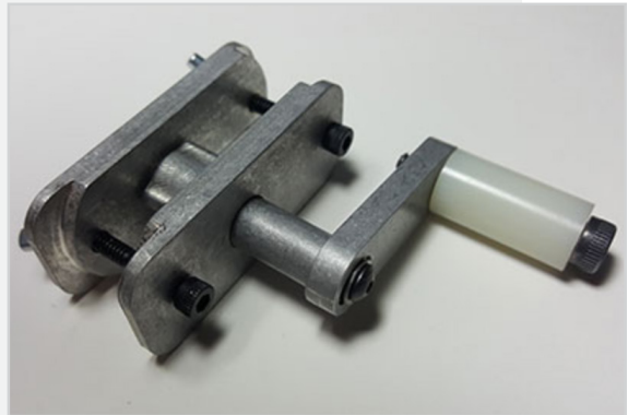
Trigger Cranks.