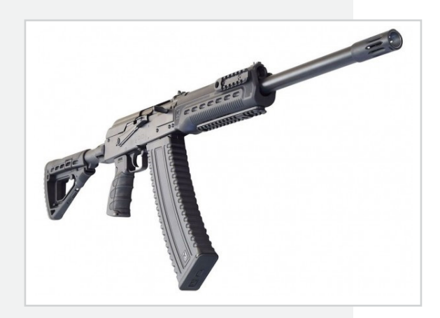
Kalashnikov KS-12T 12 gauge semiautomatic shotgun.