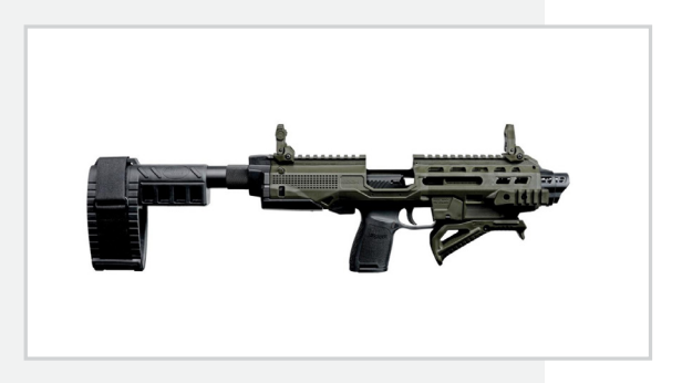
Kidon Pistol Conversion.

Sellers of the kits are not regulated by ATF, since the kits themselves do not fall within the definition of a firearm. They are, however, marketed with videos that tout the lethality of these weapons and demonstrate how to evade the law. These videos also often caution watchers to be careful not to get run afoul of the ATF by improperly using these kits.