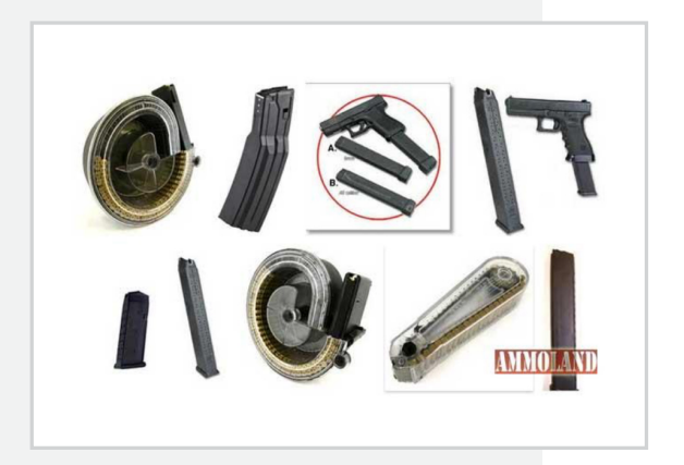
Collection of large capacity magazines.

The danger posed by firearms that enable shooters to continue firing in this manner is the same reason Congress chose to include machine guns in the NFA when it was originally enacted: these weapons enable a shooter to fire many bullets very quickly. Semiautomatic firearms equipped with large capacity magazines do not, however, fall under the NFA. The NFA refers to machine guns as those firearms that discharge more than one shot "without manual reloading, by a single function of the trigger." Firearms developed since the NFA and equipped with large capacity magazines rarely require manual reloading, but they can expel a lot of ammunition in a brief period of time. They do so by allowing a trigger to be pulled many times very easily and ensuring that there is almost always another bullet ready to go. Despite this, large capacity magazines and semiautomatic firearms equipped with them (sometimes called "assault weapons") are not regulated under the NFA, even though they pose incredible danger to our communities.